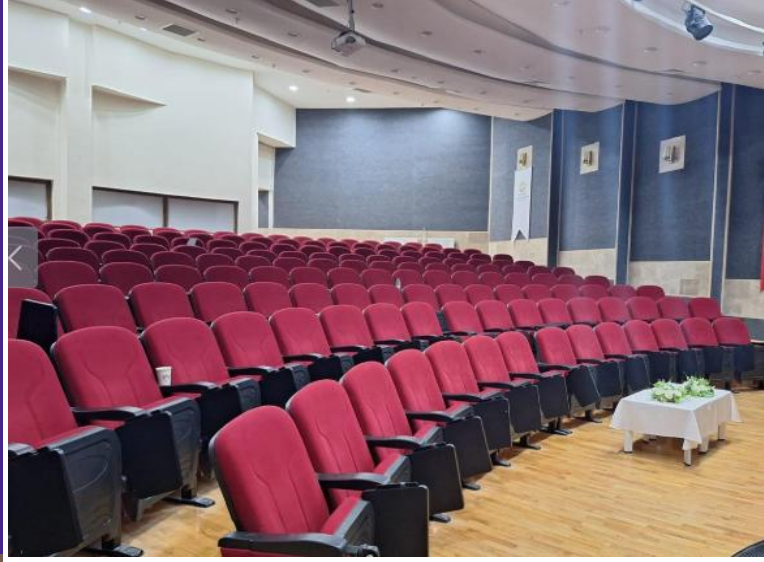
Second hall for parallel sessions

But the venue is only part of the story. The heart of the preparations lies in the dedicated team at Selçuk University, whose enthusiasm and professionalism are already shaping the spirit of the Congress.